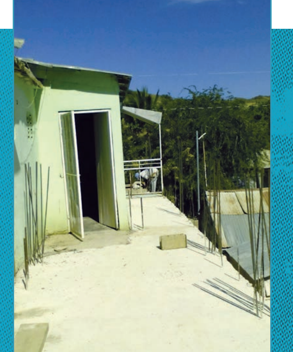
Above Left and Right: A new area was created in the second story as the concrete slab that serves as the second story floor was poured. The new area in the first story is space for the water purification system.

Below Left: Here is the new construction as seen from the rear of the center.